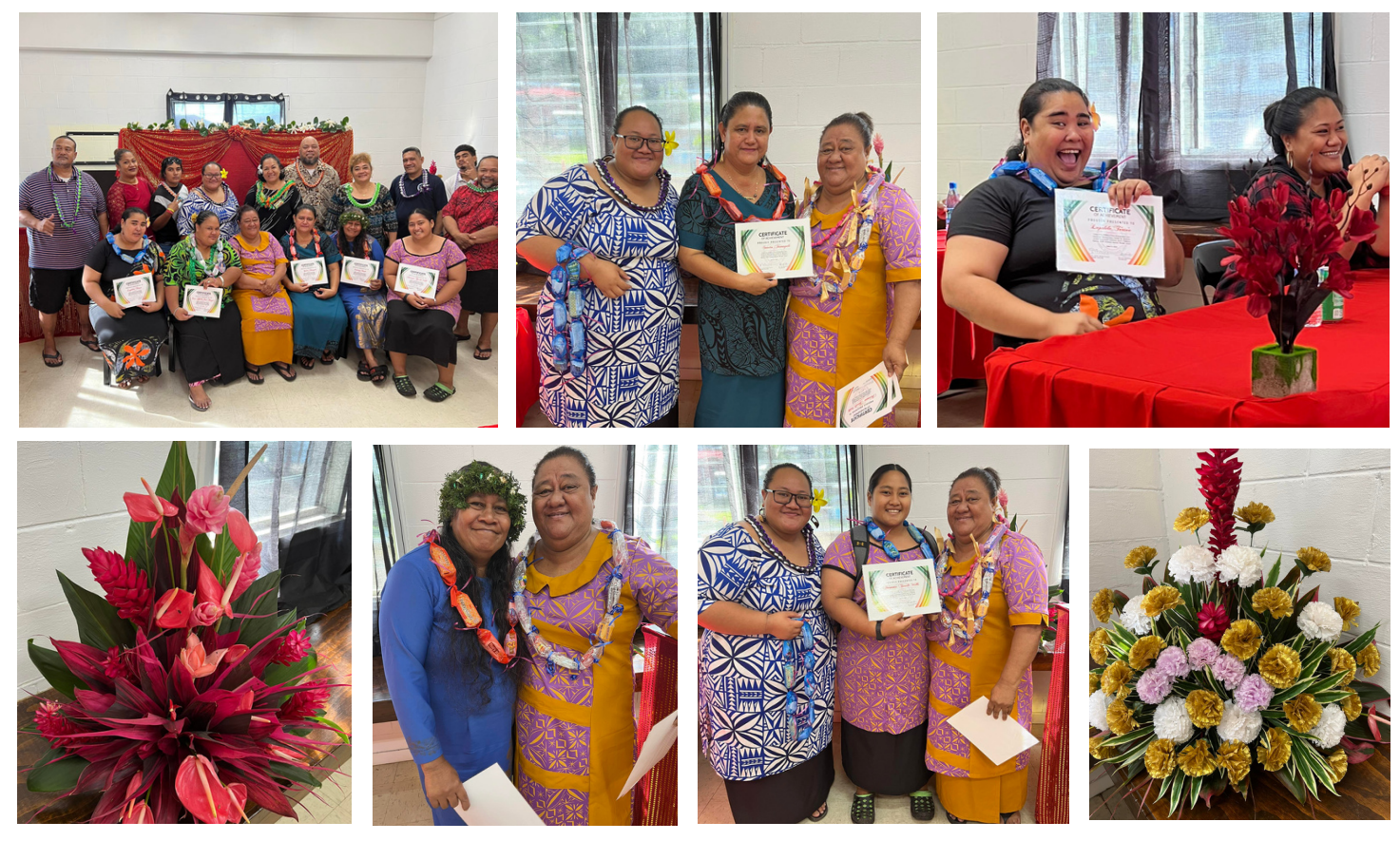
The Department of Youth and Women Affairs completed its Floral Arrangements and Handicraft program on June 21, 2023.