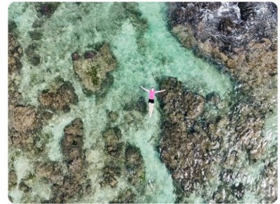
American Samoa Itinerary: 7 Days / 1 Week (Tutuila & the Manu'a Islands)