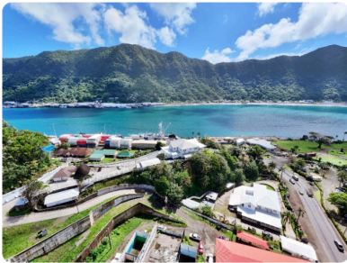
American Samoa Itinerary: 3 Days (Pago Pago)

Whether you're dreaming of a quick three-day escape or planning an epic 14-day adventure, American Samoa offers incredible trip possibilities across its pristine islands. From self-guided day trips exploring Tutuila's dramatic peaks to multi-island itineraries that showcase the territory's captivating Polynesian culture and untouched natural beauty, there's a perfect journey waiting for every type of traveller. Our comprehensive trip ideas cover everything from snorkelling expeditions in protected marine sanctuaries to immersive cultural experiences, all compiled by travel writers who've experienced American Samoa firsthand.