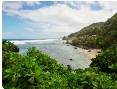
American Samoa Itinerary: 5 Days (Pago Pago & Tutuila)