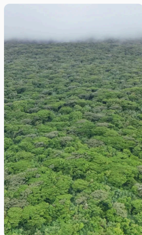
Samoa Weather in October