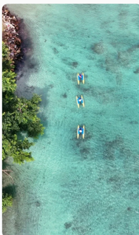
101 Best Things to Do in American Samoa: The Ultimate List

Travel Tips ▾ Destinations ▾ Accommodation Things To Do ▾ Transport ▾ Trip Ideas