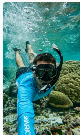
The Best Snorkelling in American Samoa: Top 10 Places to Snorkel