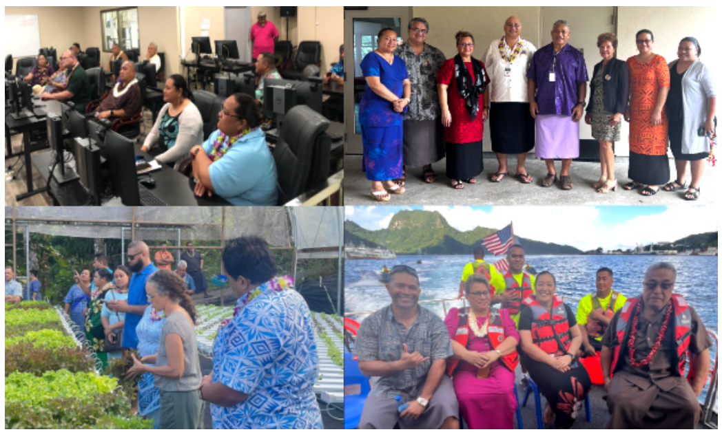
Site visits to several government and private sectors key developments hosted by various leaders of the American Samoa Government for the Samoa delegation. Kicking off the beginning of the third Atoa o Samoa executive meeting.

On Tuesday, April 11, 2023, the Honorable Fiame Naomi Mataafa, Prime Minister of the Independent State of Samoa, along with the Samoa delegation, arrived safely in Pago Pago, American Samoa for the third Atoa o Samoa executive meeting. The utility of site visits was first initiated by the Samoa government in 2022 and now repeated in 2023 to continue with discussions counterpart departments, agencies and key development sectors. The area of focus are as follows along with the relevant departments: