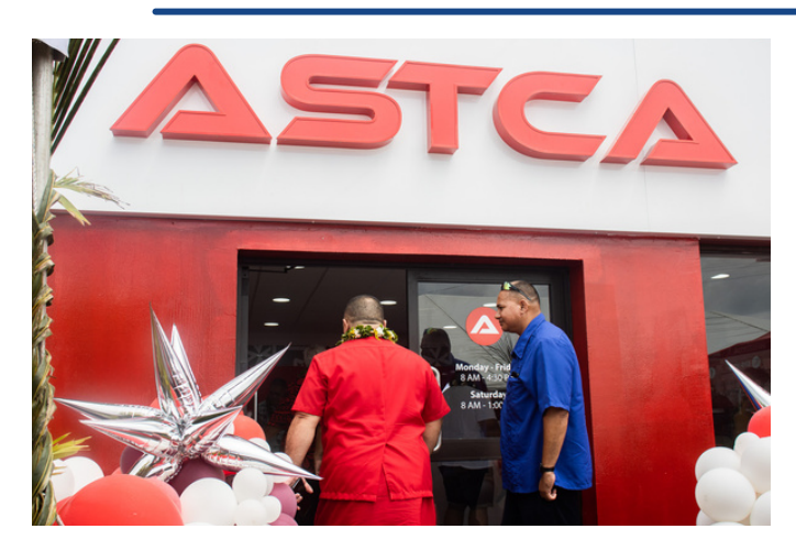
Where the road ends, 5G begins!

On Saturuday, April 15, beginning in the village of Poloa, ASTCA again makes history in the Emerging Island Nations of Polynesia. Your #HomeTeam has become the first telecom company in the Samoan archipelago and nearby Island nations to broadcast a 5G umbrella service over its commercial network.